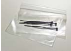
Polythene Tube and Cable Ties